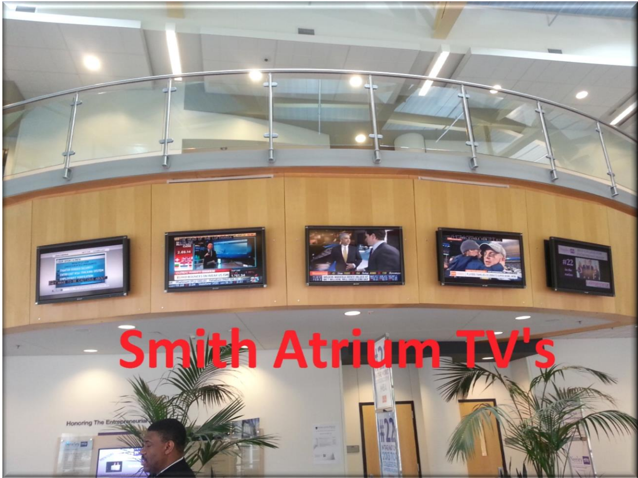
Smith Atrium TV's